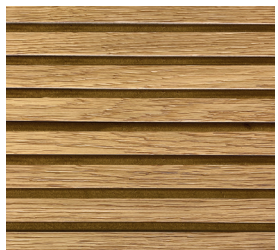
oak wood veneer