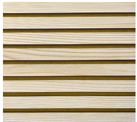
silver fir wood veneer