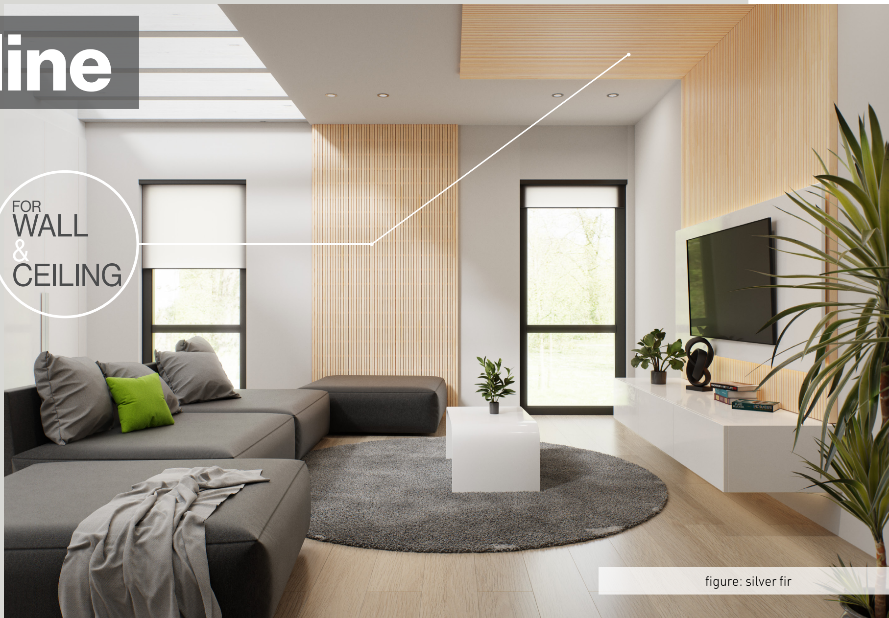
figure: silver fir