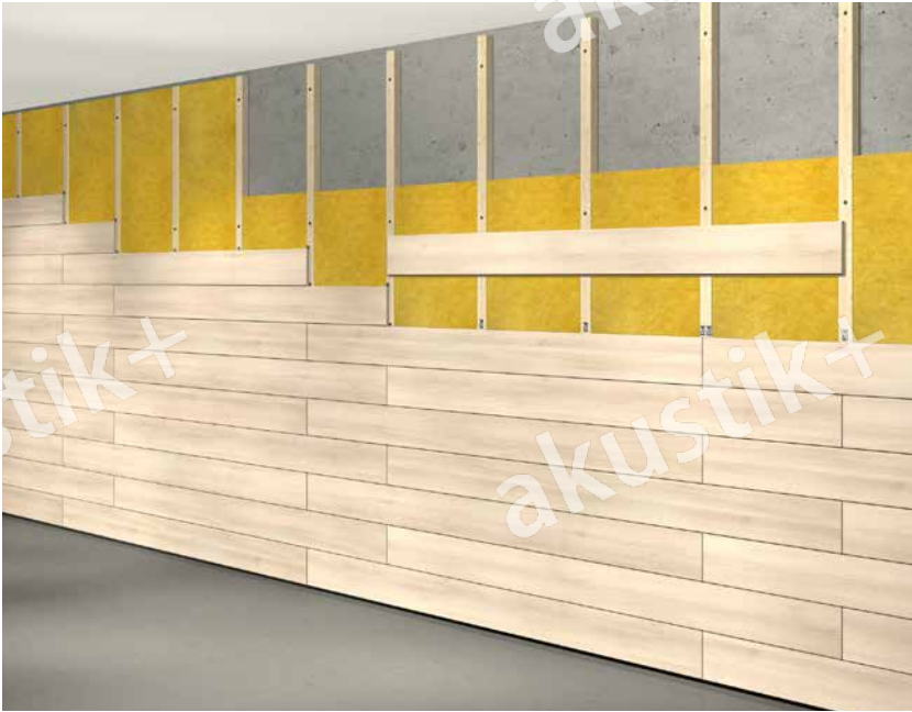
horizontal mounting in brickstone optic