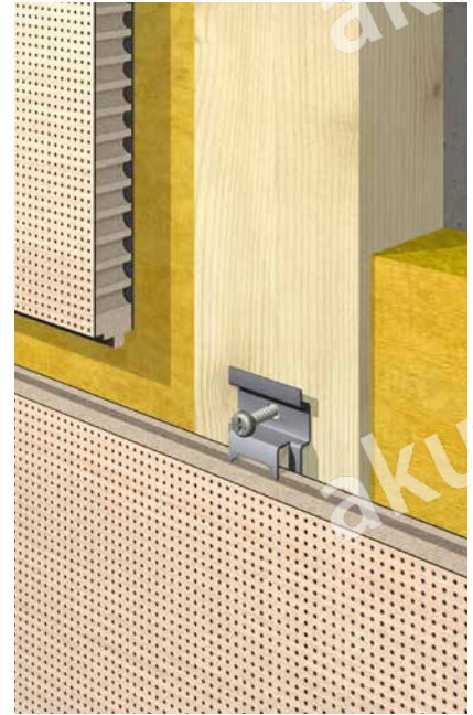
Detail horizontal installation with installation clip