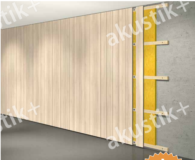
vertical mounting without backjoint